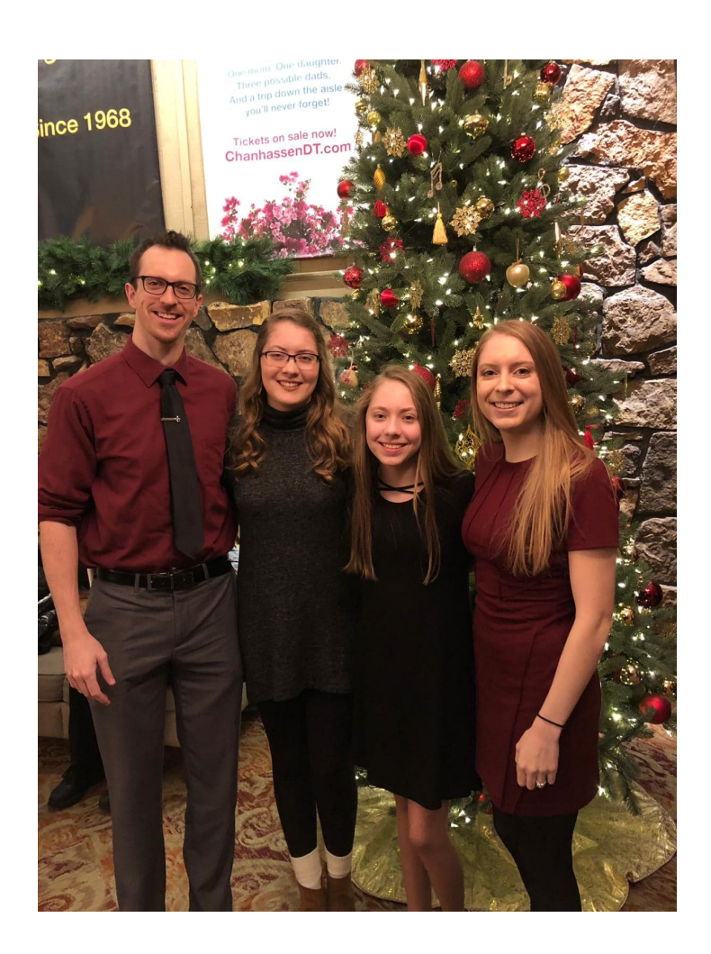
Chanhassen Dinner Theater. Super fun day!