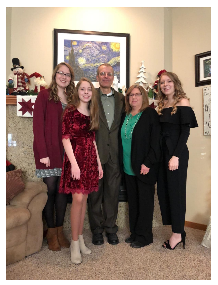
Christmas Eve family pic!