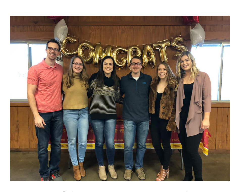
Some of the cousins at Tanners graduation celebration