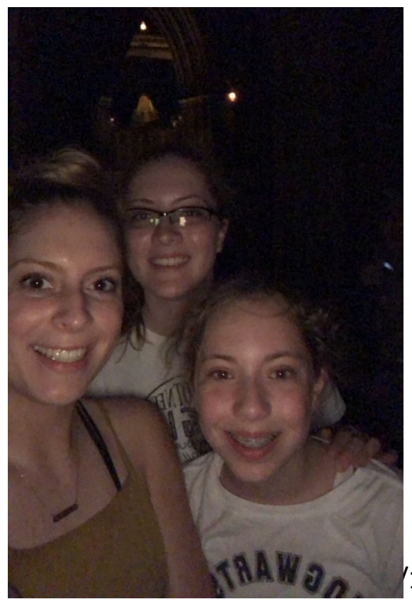
Selfie with Dumbledore at Harry Potter World