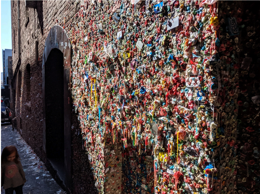
Seattle's famous "Gum Wall" I found this way more exciting than it should have been.