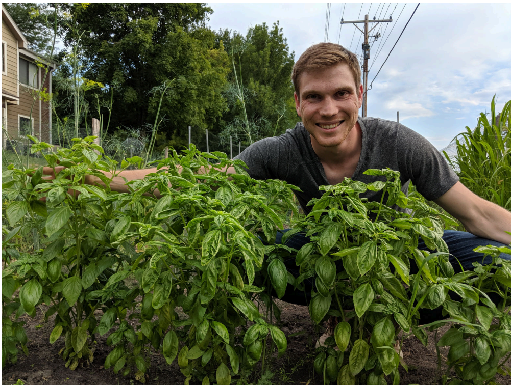
I was able to rent a garden plot at ISU and grow a whole bunch of herbs (the deer ate the vegetables). Was particularly proud of the basil.