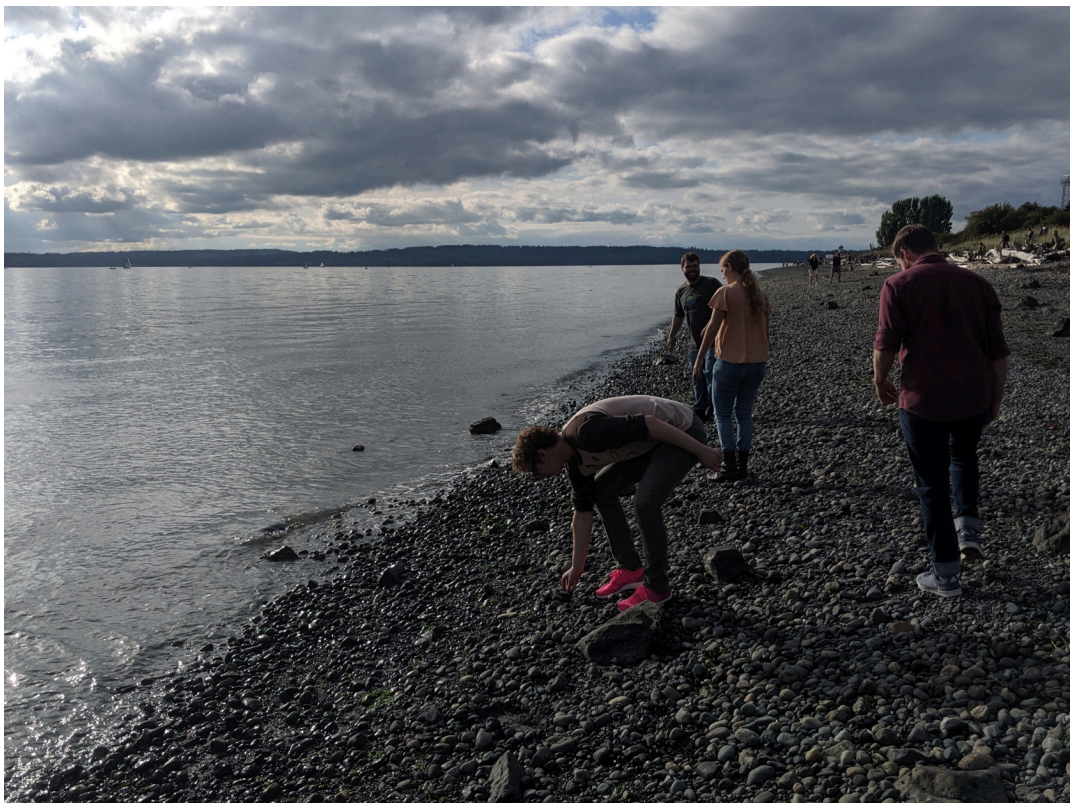
Skipping rocks in Discovery Park with some other east-of-the-Rockies transplants.