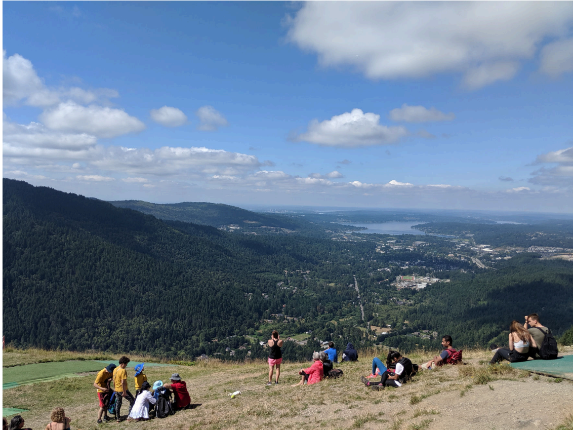
Tiger Mountain. You can watch paragliders launch from here.

There's still a lot for me to explore around here, but here are a few pictures of places I've already visited.