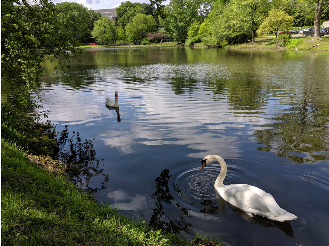
Lancelot and Elaine on Lake LaVerne.