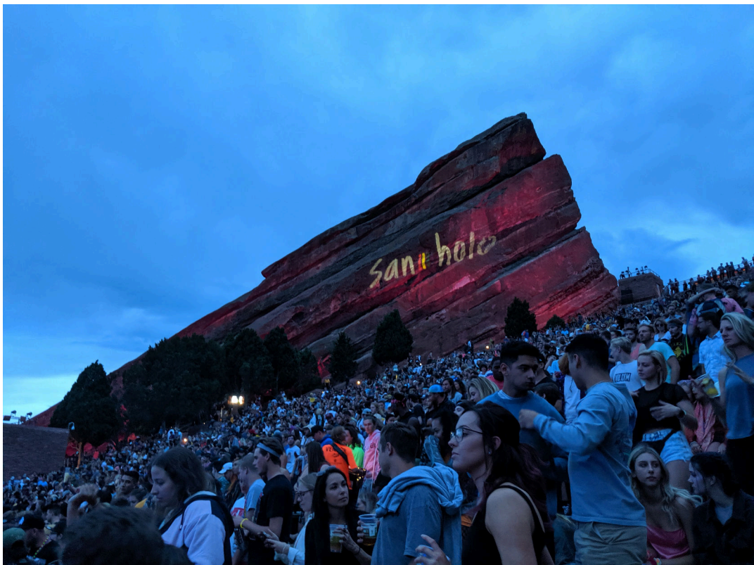
Saw my favorite artist play at Red Rocks in Denver.