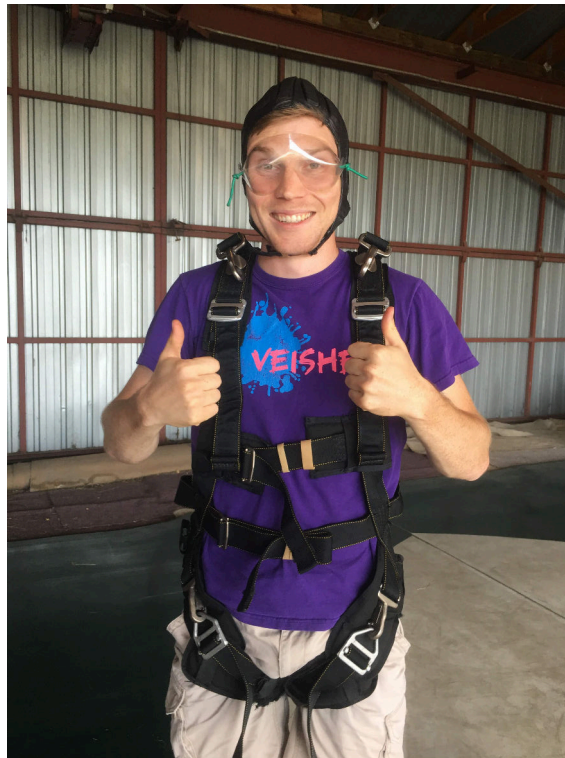
Turns out you can go skydiving in Boone!