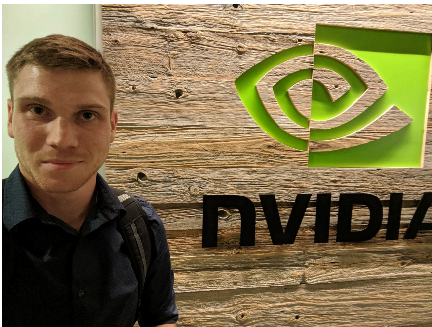
Obligatory first-day-of-work selfie.

Of course, the whole reason I moved was for my first job, so I can't leave that out!