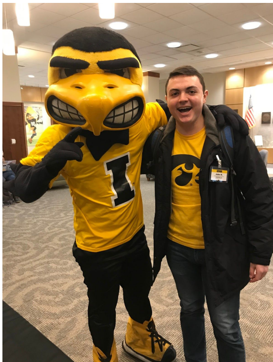
Here's me with Herky before a tour. I'm a campus tour guide at The University of Iowa.