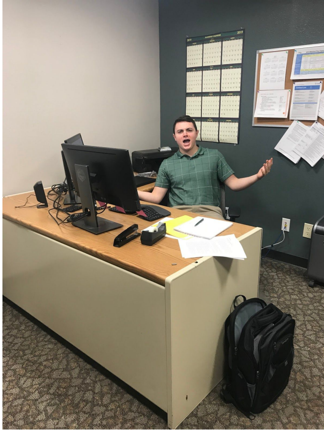
Here's my office at Musco (my friends and I would have pizza Friday in here)